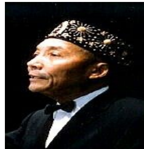
The Honorable Elijah Muhammad Messenger Of Allah

America shows no signs of feeling sorry for the way she has treated the so-called Negroes of so-called African Americans. She has no intention of recognizing us as human beings and continues to play tricks on us, even through our poor black civil right's leadership. The ignorant integrationist black leadership seeks to get the masses of Black people to forgive white people. This in spite the fact that white people openly show that they (whites) do not and will not ask for forgiveness for